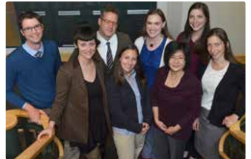
Class of 2017

Family medicine is an area of medicine devoted to providing comprehensive health care for people of all ages. Based on knowing the patient well within the context of family and the community, family medicine doctors emphasize preventing disease and promoting better overall health. By having a whole-person interest, family medicine doctors help patients get the best care despite complex conditions and health delivery systems. Thank you for your gifts to support our Family Medicine residents. ■